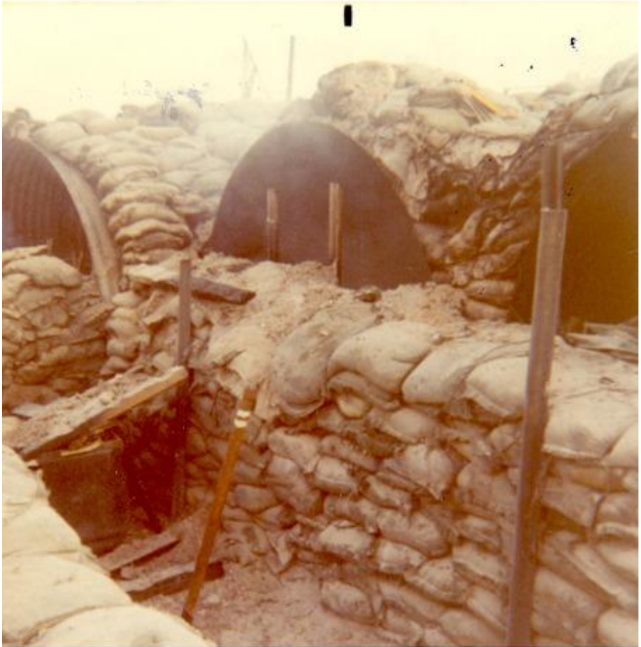
Sandbagged trench and bunker damage next morning