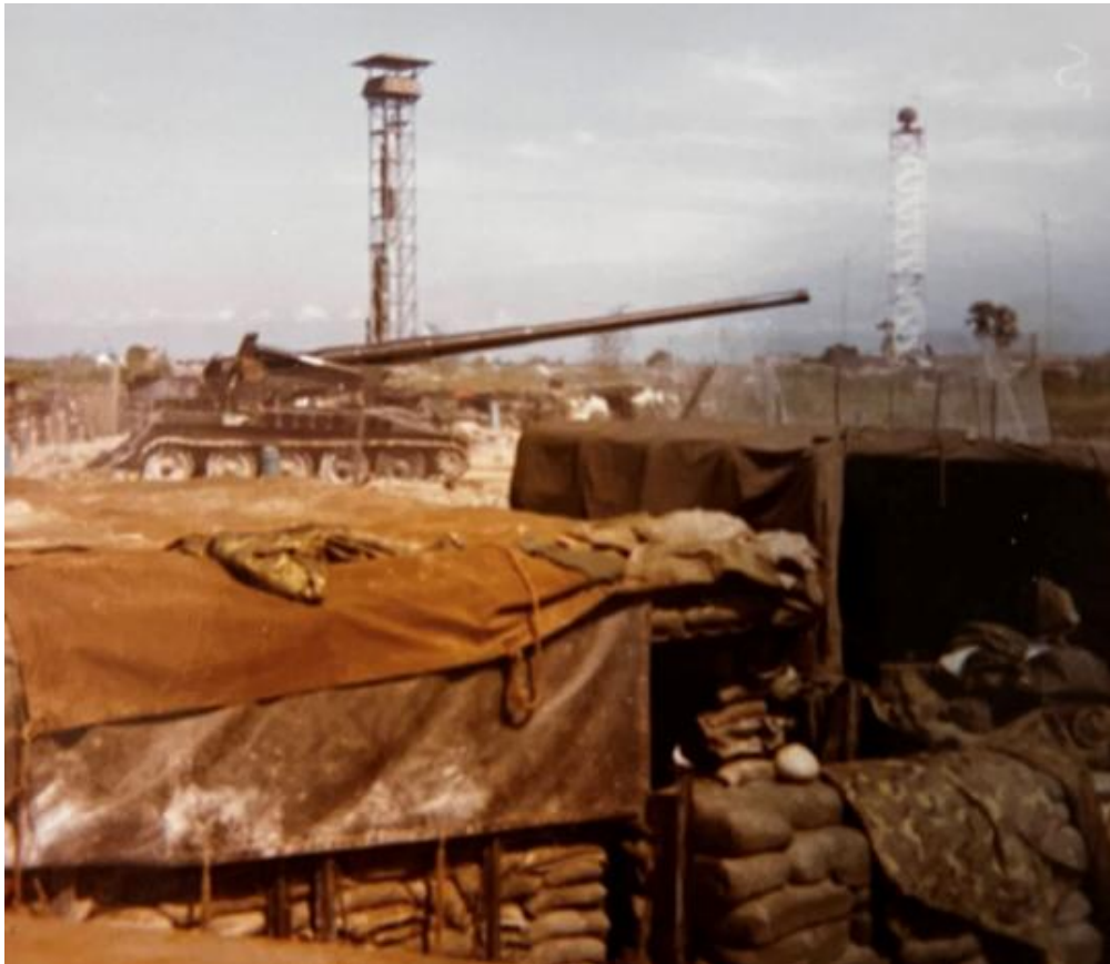
175mm gun with visual and radar towers in the background