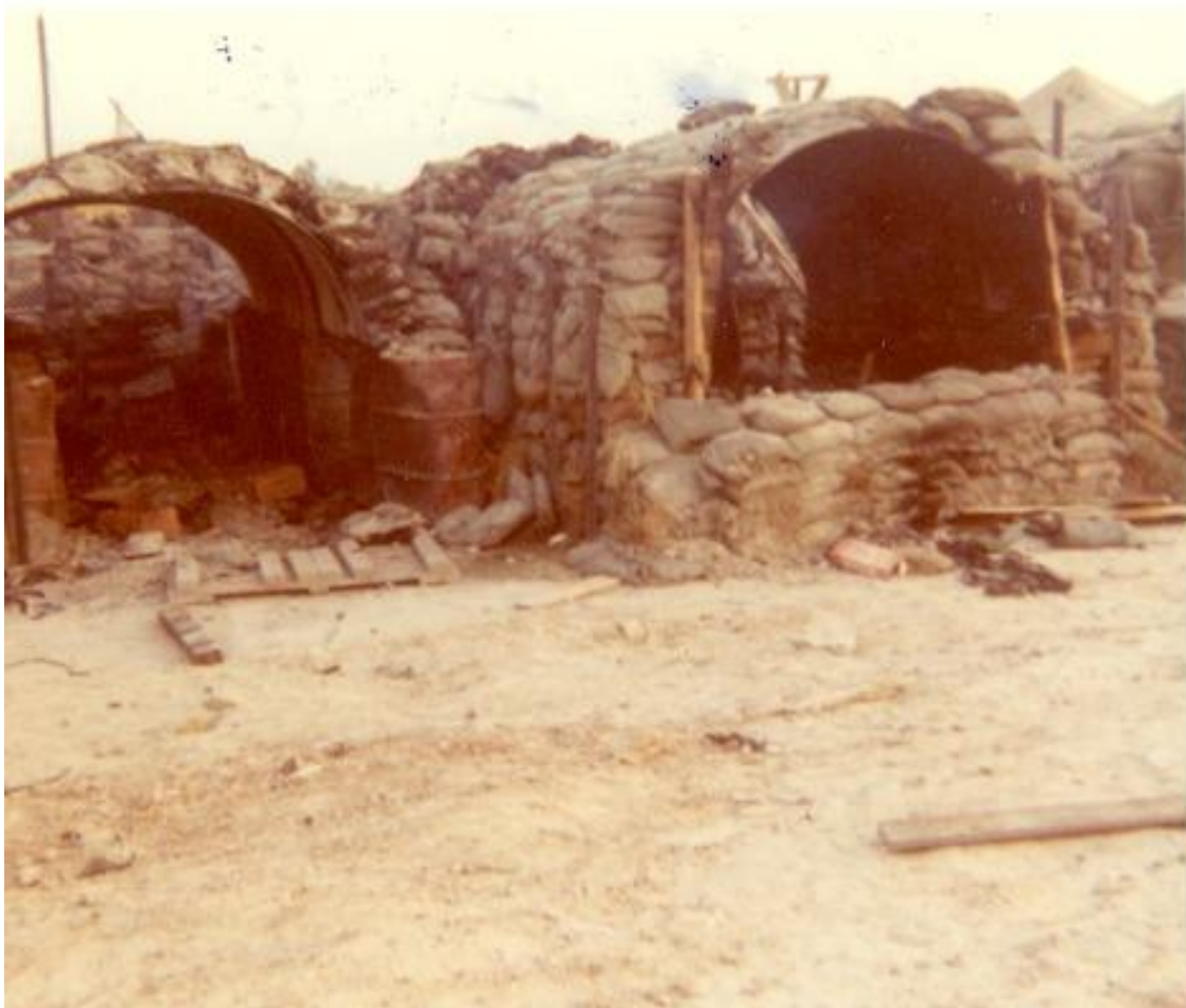
Another view of the sleeping bunkers and damage