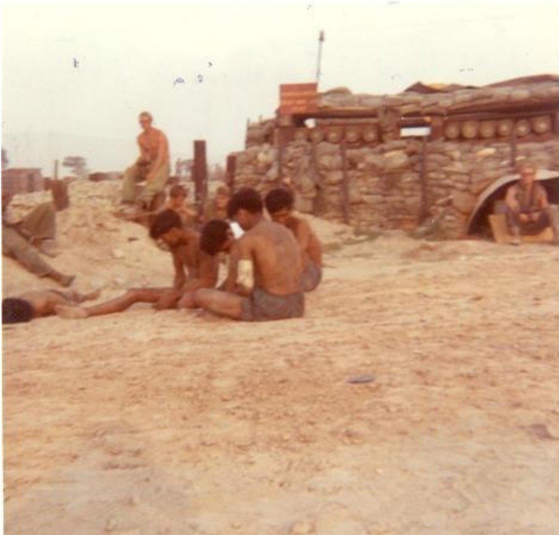
These four North Vietnamese sappers were found at daylight hiding in one of the bunkers. Choosing to surrender over death.