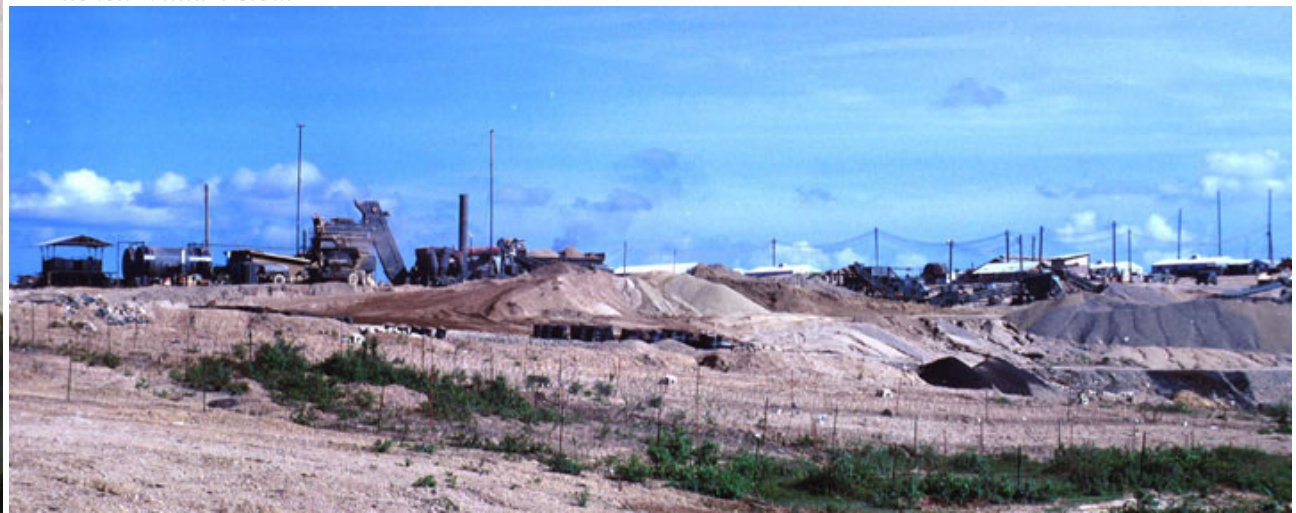
Charlie Battery was headquartered at the "rock crusher" a short distance outside Dong Ha Combat Base's main perimeter. From here, C/1/44 crews were dispersed to positions such as Khe Gio Bridge.