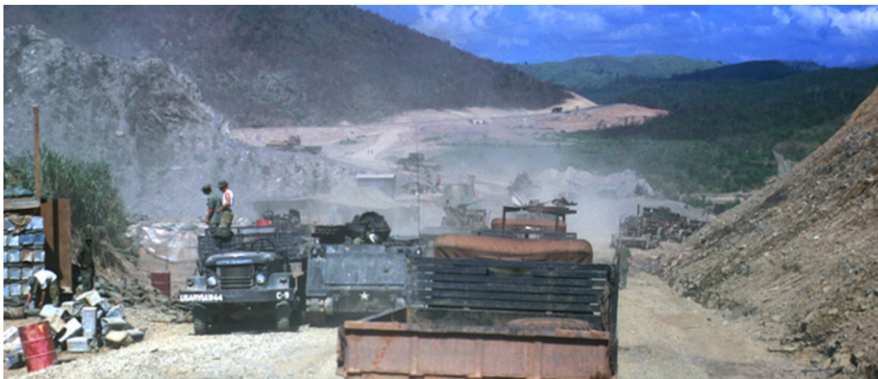
Charlie Battery men at Khe Gio Bridge (center of photo).

The U.S. Army outpost at Khe Gio Bridge on Highway 9 near the DMZ was overrun by North Vietnamese troops on 12 March 1970. Of the 14 Americans who fought in this battle, 2 were killed, 5 wounded, and 1 captured. The ARVN garrison had 6 dead and 9 wounded. The NVA lost about 40 men.