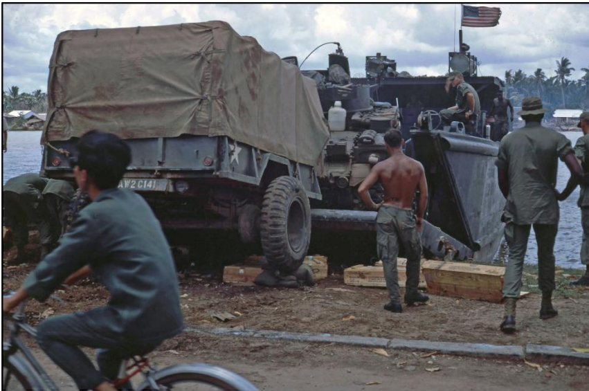
Duster being loaded aboard a Mike-8 landing craft

As far as my personal experiences, I don’t think it was particularly different from most in Vietnam. Sometimes rather boring, sometimes terrifying, but always interesting. I volunteered for the draft after my freshman year of college. After basic training at Fort Lewis, I was sent to Fort Benning to be trained as a field radio mechanic and then next a 30-day leave, sent to Vietnam. I was assigned to C-5/2 Artillery with