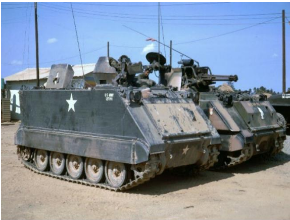
Vulcan 20mm Combat Team