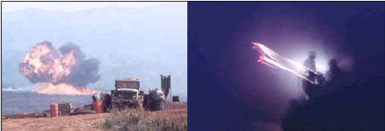
F-14 Phantoms, Puff the Magic Dragon and B-52s made the area surrounding Khe Sanh the most bombed, strafed and pulverized place on the planet. At right, a Quad 50 lights up the night sky.

I remember moving cautiously through the trenchline one clear morning when a careless young Marine stood up and walked across an open stretch of ground between unconnected trenches. In an instant he was