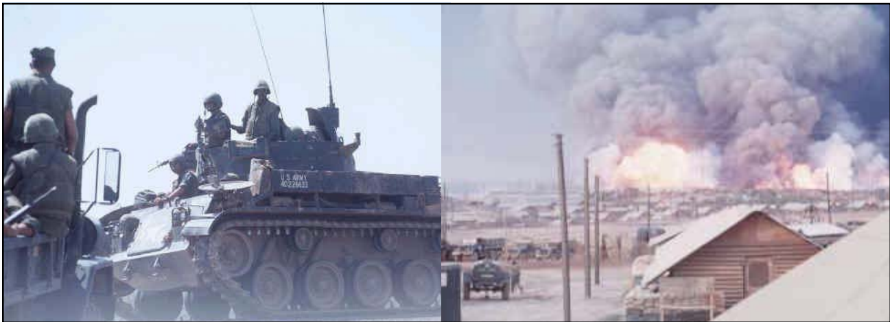
At left, a Duster crew prepares for a convoy escort mission. At right, the ammunition dump at Dong Ha explodes in geysers of flame and smoke after a direct hit by a North Vietnamese Army rocket.

Bravo Battery as a platoon leader and spent most of the remainder of 1967 with Duster sections or squads at Marine firebases at Con Thien and Cam Lo.