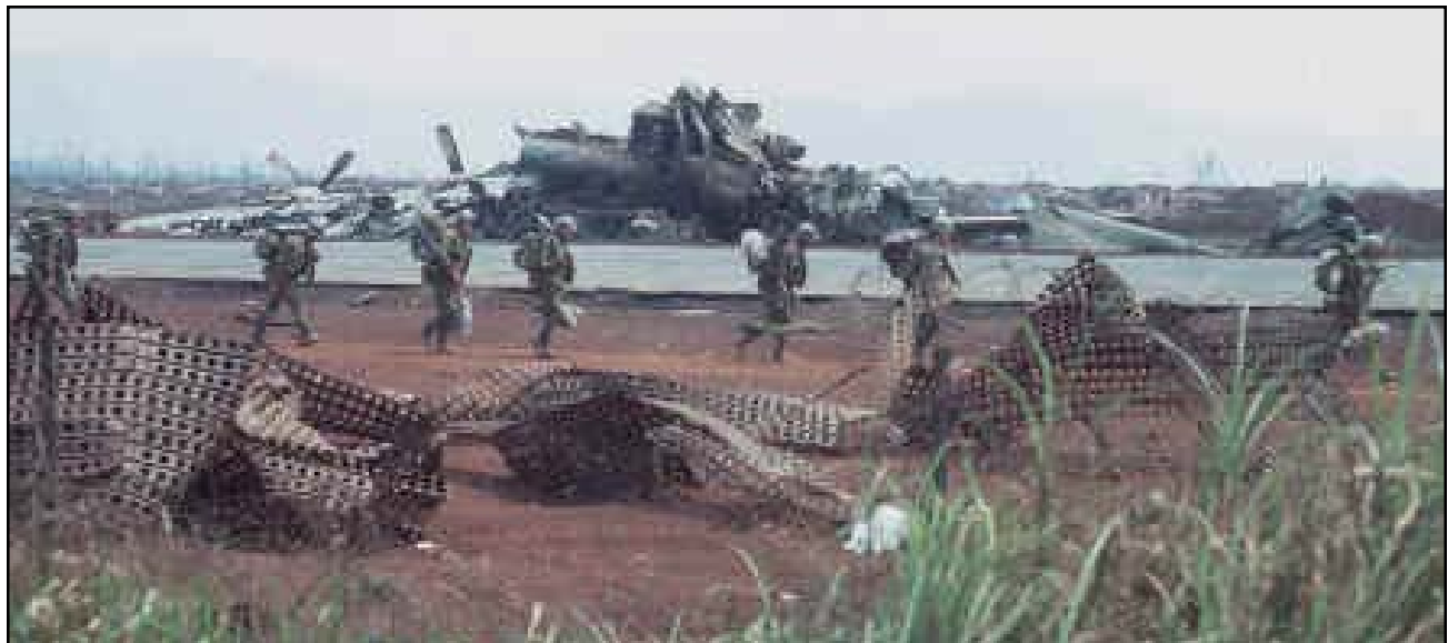
A crack ARVN Ranger battalion moved onto the combat base with support aircraft and equipment.