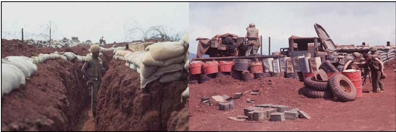
The Marines hurriedly dug trenches and laid rows of concertina wire. At right, truck-mounted Quad 50 crewmen check out an engine block that was zapped by a near direct hit by an NVA rocket.