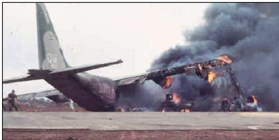
Struck by incoming rounds, the C-130 smashed into a forklift and burst into flames

NVA gunners had the airstrip zeroed in, and few fixed-wing aircraft were able to land without being hit or destroyed. My bunker was only a few yards off the edge of the runway, and every landing and takeoff was a nerve-wracking adventure. One quiet morning, I had my 35mm camera in hand as a C-130 Hercules landed and rolled toward the turnaround ramp at the west end of the runway. As I watched in horror, incoming rounds slammed into the runway and apparently struck the C-130's left main landing gear, causing the aircraft to swerve and smash into a forklift waiting nearby to unload the cargo. The wing tanks burst into flame that quickly engulfed the aircraft, as the courageous fire crew unsuccessfully fought to extinguish the flames. I ran down the runway toward the aircraft, capturing much of the action on film. Runway personnel had rescued the crew, who escaped with only minor injuries, but the aircraft and its cargo were totally destroyed.