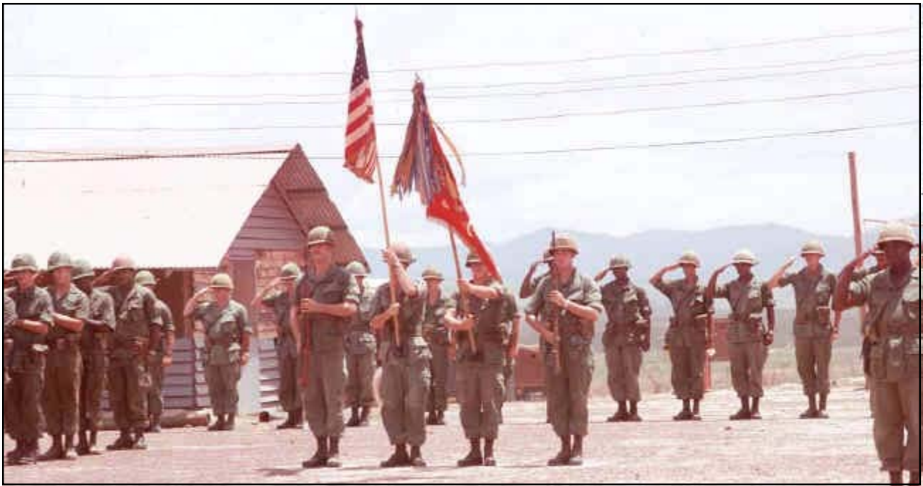
Alpha Battery, 1st Battalion, 44th Artillery, in formation for an awards ceremony. The heroism its soldiers displayed during the long struggle in Vietnam made the battalion one of history's most decorated artillery unit. The battalion became 1-44 ADA in 1968 when Air Defense Artillery was separated from Field Artillery and became a separate combat arms branch.