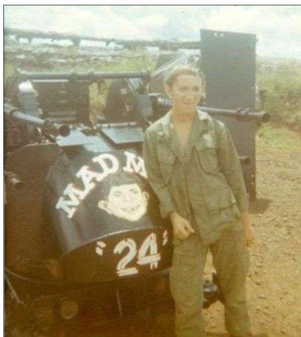
MAD MAN "24"