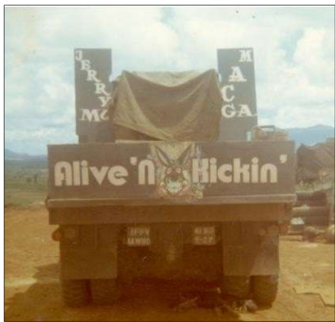
ALIVE "N" KICKIN"