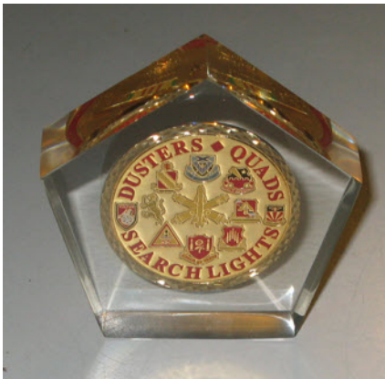
Patch Coins and Pin Sets