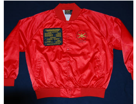
Light Jacket front (above) Back of jacket (below)