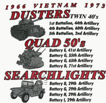
NDQSA T-Shirt front (above) back of T-Shirt (below)