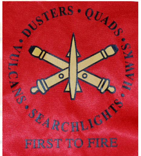
Front of Jacket Logo (above) Patch with units (below)