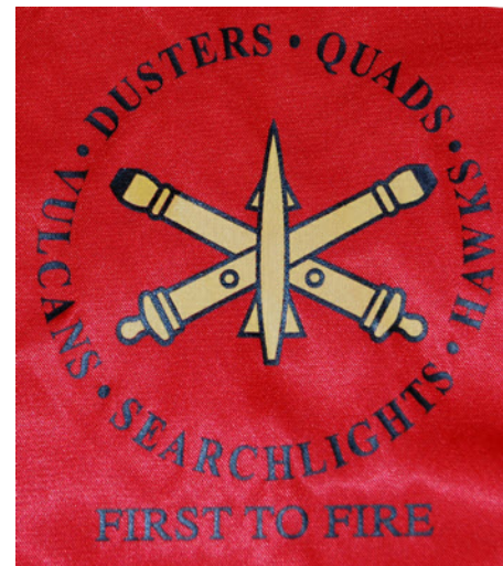
Front of Jacket Logo (above) Patch with units (below)