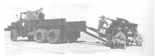
4. Diagram of crew loading the mount M55:

We all know that the M-55 quads were a trailer mount that could be ground deployed or put on the back of a 2.5 or 5-ton truck. Well in 2006, the model company AFV Club came out with a model of a Vietnam Era Quad-50 mounted on a version of an APC.