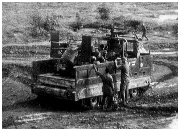
Quad mounted on M548

I was very surprised when I got Mel Crum’s photos to archive and found a 1968 photo of a G-55 th Quad mounted on the M-548!