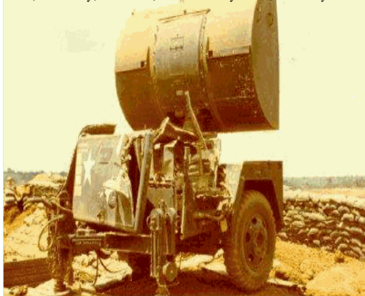
Btry C, 6th Bn, 56th Arty (HAWK) motar hit on CWAR radar on Mother's Day, 10 May 1969 at LZ Oasis, Photo by Eddie Donato

Btry C, 6th Bn, 56th Arty, LZ Oasis, Mother's Day 1969. Photo by Eddie Donato