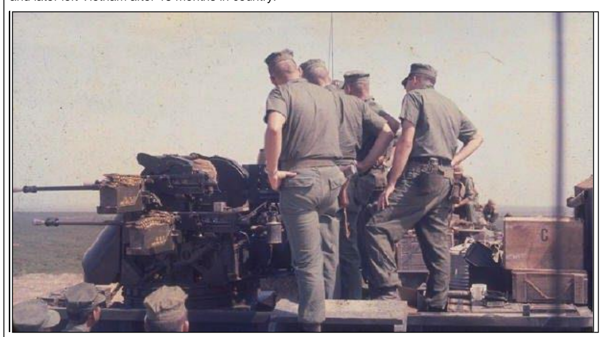
3_{rd} Marine Division Officers inspect a Quad soon after our arrival in Dong Ha Notes:

That night was spent in the MACV compound under almost continual enemy fire. I did not notice until we were in the compound that I had injuries to my left leg. As a result I was medevaced to Subic Bay in the Philippines via Hospital Ship the following day. A few weeks later I returned to the G-65th and later left Vietnam after 18 months in country.