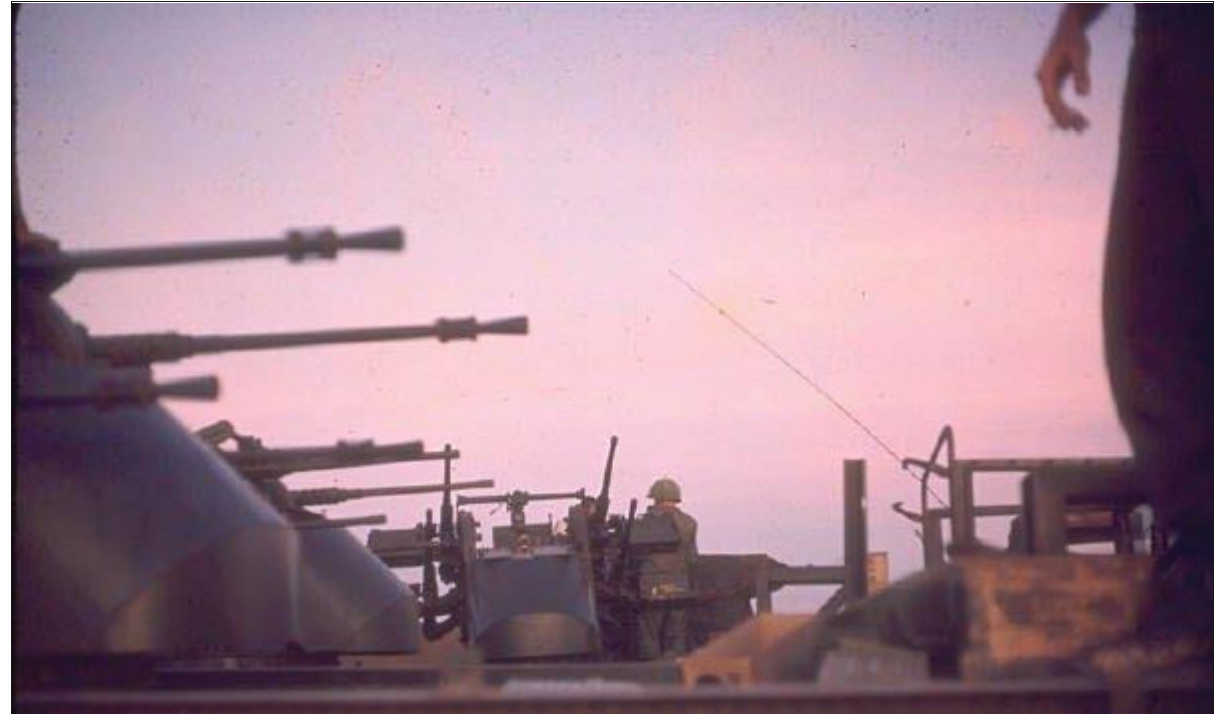
At Fort Bliss, Texas, Quad 50 crews trained against aerial targets, but in Vietnam they provided antipersonnel firepower for perimeter defense at besieged firebases and pulled convoy escort duty for friendly forces moving along frequently ambushed highways.

It was always exciting to provide convoy escort duty through the historic Vietnamese provincial capital of Hue. There was a tendency to relax, unbutton the flak jacket, and take off the steel pot. Our gunner would climb out of the sling and sit on the back of the gun mount. We admired our surroundings as we crossed the Nguyen Hoang Bridge across the Perfume River and saw the massive stone walls of the Citadel. We particularly paid attention to the graceful young girls in their Ao Dais whom we supposed were students at the nearby University of Hue. We were looking forward to cold beer and hot chow with our comrades at the 1st Battalion of the 44th Artillery area in Phu Bai.