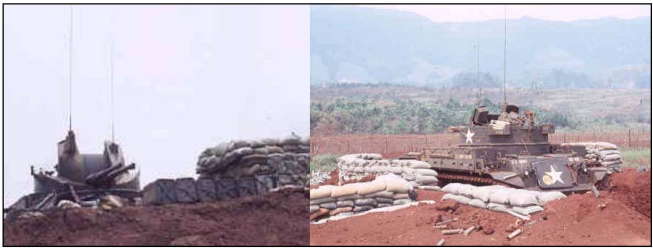
Dusters and Quad 50s had excellent fields of fire, commanding all avenues of approach to the northern perimeter of the combat base.

Incoming mortars and artillery rounds exploded all around the landing area. The pilot didn't even land the chopper. The crew chief lowered the tailgate to the ground as the chopper hovered and we were dumped out like a heap of garbage from the rear of a sanitation truck. We scattered like rats for the nearest trenchline or bunker and waited in sheer terror for what seemed like an endless barrage to be over. The chopper disappeared into the clouds without retrieving any of the casualties it had come for, and the incoming rounds finally ceased. We huddled for at least another twenty minutes before mustering the courage to crawl out from the relative safety of the trenches, and we made our way across the airfield. We found our gun positions along the northern perimeter of the runway and settled in with our beleaguered comrades to rest and be briefed about the situation at hand.