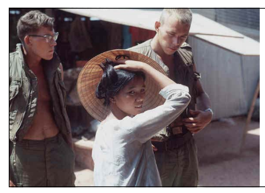
"Some soldier's names I no longer remember, but they are nevertheless deserving of recognition for their courageous service during the siege of Khe Sahn."

the continual carpet-bombing was never more evident than it was along the first five miles of winding roadway to the Marine outpost at Ca Lu. The once dense foliage was burned out or blown away for miles around the roadway, and the ground was pockmarked with huge bomb craters for as far as the eye could see. Despite this carnage, it was an exhilarating experience for my men and I, who were ecstatic to finally be out of Khe Sanh and on our way back to Dong Ha.