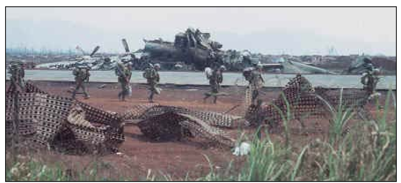
A crack ARVN Ranger battalion moved onto the combat base with support aircraft and equipment.