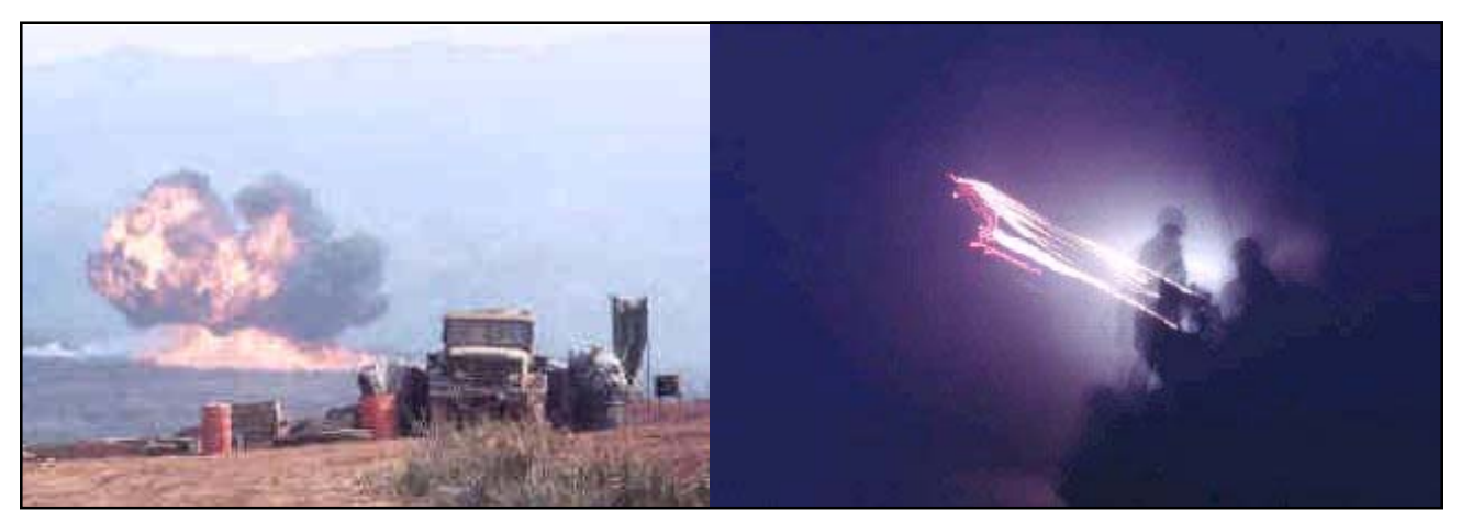
F-14 Phantoms, Puff the Magic Dragon and B-52s made the area surrounding Khe Sanh the most bombed, strafed and pulverized place on the planet. At right, a Quad 50 lights up the night sky.

I remember moving cautiously through the trenchline one clear morning when a careless young Marine stood up and walked across an open stretch of ground between unconnected trenches. In an instant he was