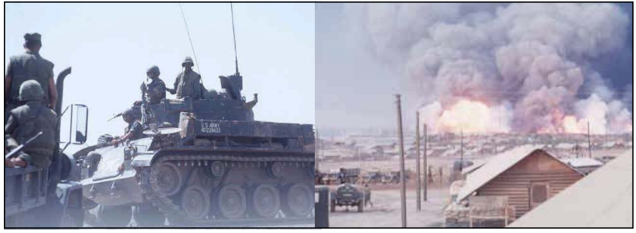
At left, a Duster crew prepares for a convoy escort mission. At right, the ammunition dump at Dong Ha explodes in geysers of flame and smoke after a direct hit by a North Vietnamese Army rocket.

Bravo Battery as a platoon leader and spent most of the remainder of 1967 with Duster sections or squads at Marine firebases at Con Thien and Cam Lo.