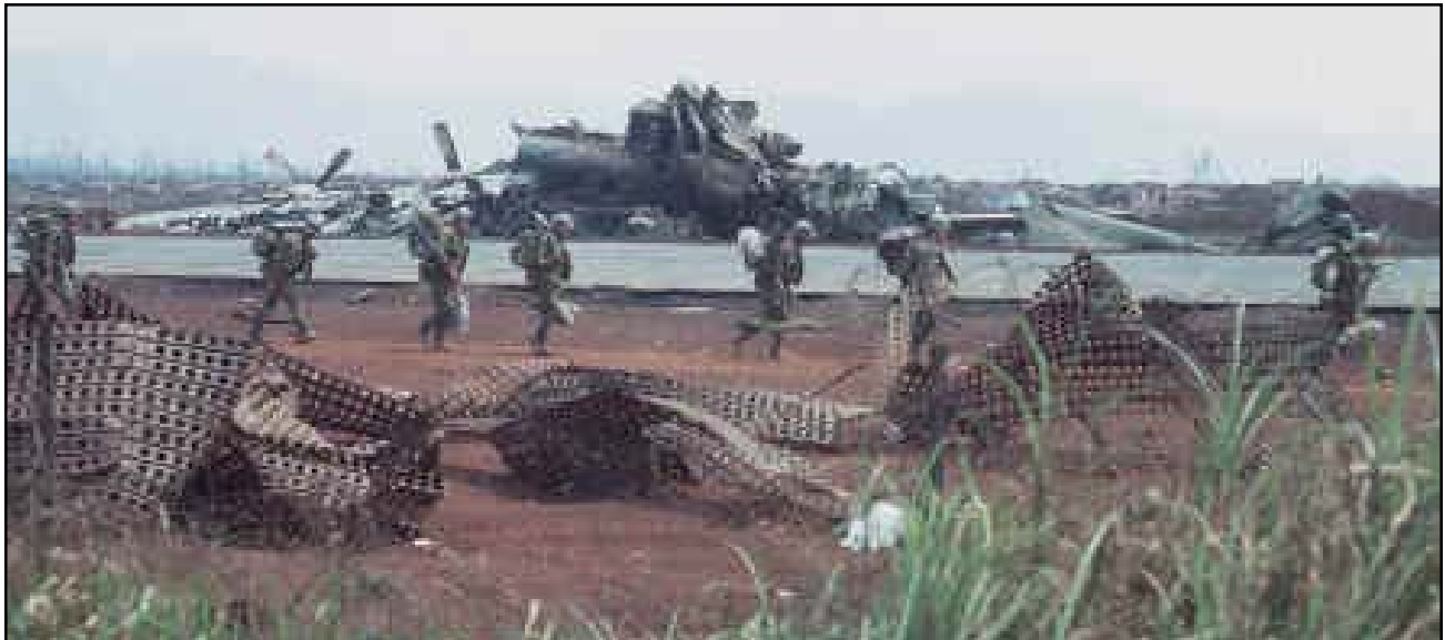
A crack ARVN Ranger battalion moved onto the combat base with support aircraft and equipment.