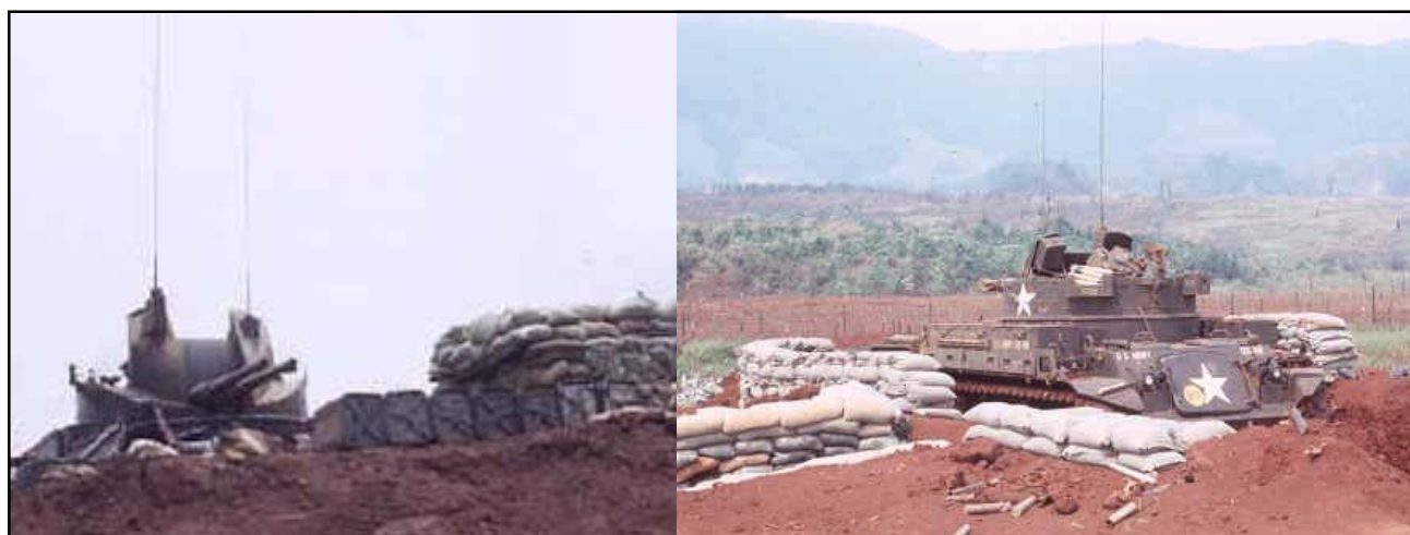
Dusters and Quad 50s had excellent fields of fire, commanding all avenues of approach to the northern perimeter of the combat base.

Incoming mortars and artillery rounds exploded all around the landing area. The pilot didn't even land the chopper. The crew chief lowered the tailgate to the ground as the chopper hovered and we were dumped out like a heap of garbage from the rear of a sanitation truck. We scattered like rats for the nearest trenchline or bunker and waited in sheer terror for what seemed like an endless barrage to be over. The chopper disappeared into the clouds without retrieving any of the casualties it had come for, and the incoming rounds finally ceased. We huddled for at least another twenty minutes before mustering the courage to crawl out from the relative safety of the trenches, and we made our way across the airfield. We found our gun positions along the northern perimeter of the runway and settled in with our beleaguered comrades to rest and be briefed about the situation at hand.