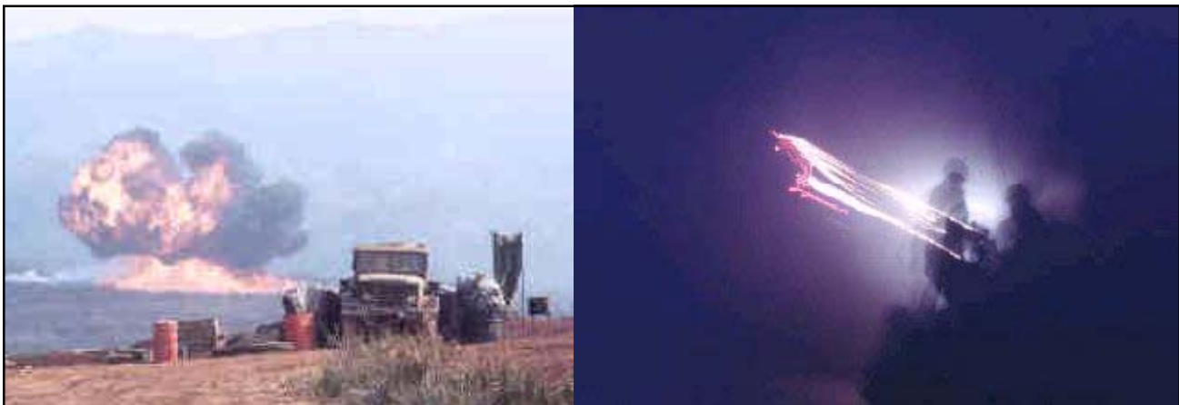
F-14 Phantoms, Puff the Magic Dragon and B-52s made the area surrounding Khe Sanh the most bombed, strafed and pulverized place on the planet. At right, a Quad 50 lights up the night sky.

I remember moving cautiously through the trenchline one clear morning when a careless young Marine stood up and walked across an open stretch of ground between unconnected trenches. In an instant he was